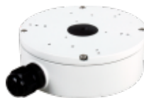
A22 Junction Box