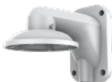
A25 Corner/Pole Mount