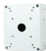
811 Junction Box