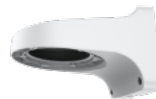
A28 Wall Mount