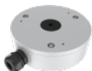
TC-P54BM Spec: V1 Junction Box