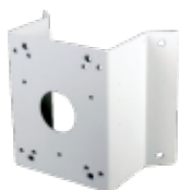
A35 Corner Mount