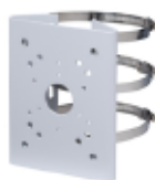
A36 Pole Mount