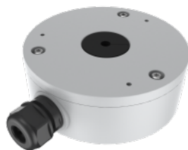
TC-P54BM SPEC: V5 JUNCTION BOX