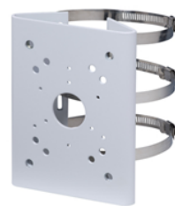
A36 POLE MOUNT